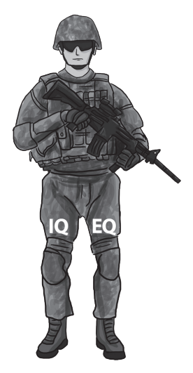
Figure 1: The importance of the modern military leader standing solid on two feet based on emotional and cognitive intelligence and competences.

people have a congenital capacity for emotional skills, where others like Lutz (1988) argued that particular cultural systems, social and material environments will inevitably structure emotional meaning, and claimed that emotional experience is predominantly cultural. Among other things, the experience taken on board during emotional problem solving often determines the extent to which emotional capacity is developed into intrinsic skills. Research by Damasio (2003) has shown that human beings cannot make any cognitive decisions without also processing emotional information that incorporates how we feel about a particular situation. Emotions can be changed, constructed and developed, they are functional and they support rational and cognitive thinking, which is a substantial part of a military leader's job in operational planning and decision processes. It is imperative that the military leader conducts his or her leadership standing on two feet, so to speak, as illustrated in Figure 1. Therefore, focusing on emotional intelligence is a very meaningful exercise, especially for military leaders.